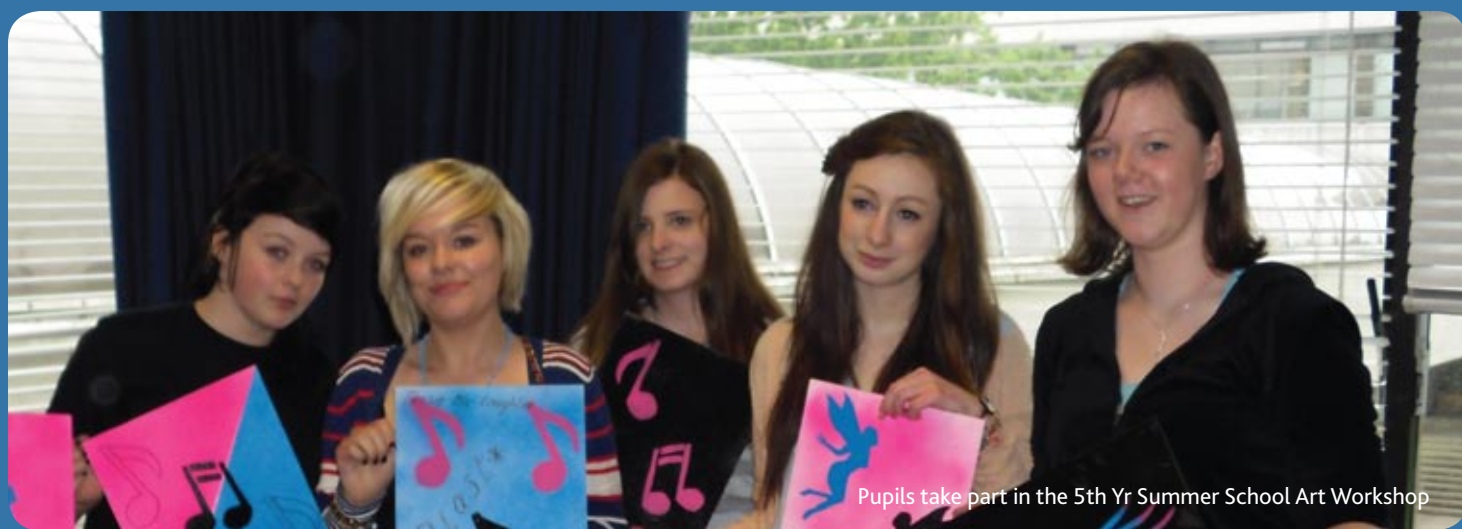
Pupils take part in the 5th Yr Summer School Art Workshop