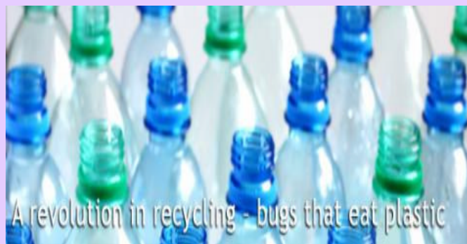
SBBS microbiologists are leading the way in the manufacture of biodegradable plastics using different organisms

We have learned to harness the enormous potential of microbes. For example, we use and engineer fungi and bacteria to produce a vast array of compounds, ranging from antibiotics and hormones to washing powder and bioplastics. The production of many foodstuffs is dependent on microbial activity, such bread, wine, yoghurt and cheese. We rely on microbes to provide us with clean drinking water and to remove contaminants from polluted soils.