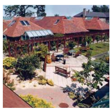
St Francis Hospice

Module Title: Psychological, Spiritual and Ethical Aspects of Palliative Care Practice